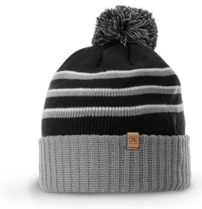
BLACK/GREY/WHITE Genuine Etched Leather Clip Label