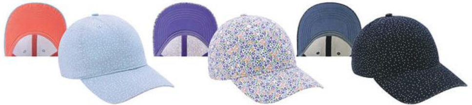
Lt Blue w/ White Polka Dots