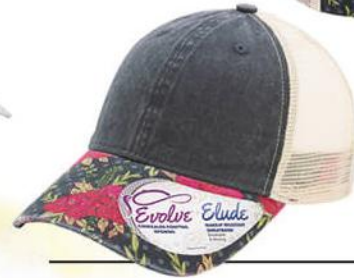
Black/ Khaki/ Floral