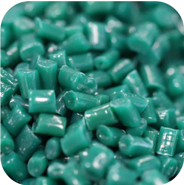
CHIPS 100% RECYCLED PE