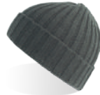
DK GREY MELANGE