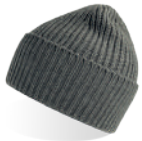
DK GREY MELANGE