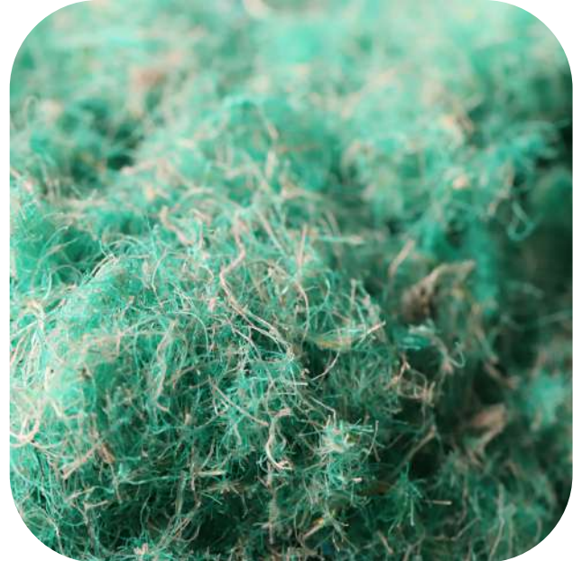
FISHING NETS SCRAPS