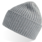
LT GREY MELANGE