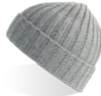
LT GREY MELANGE