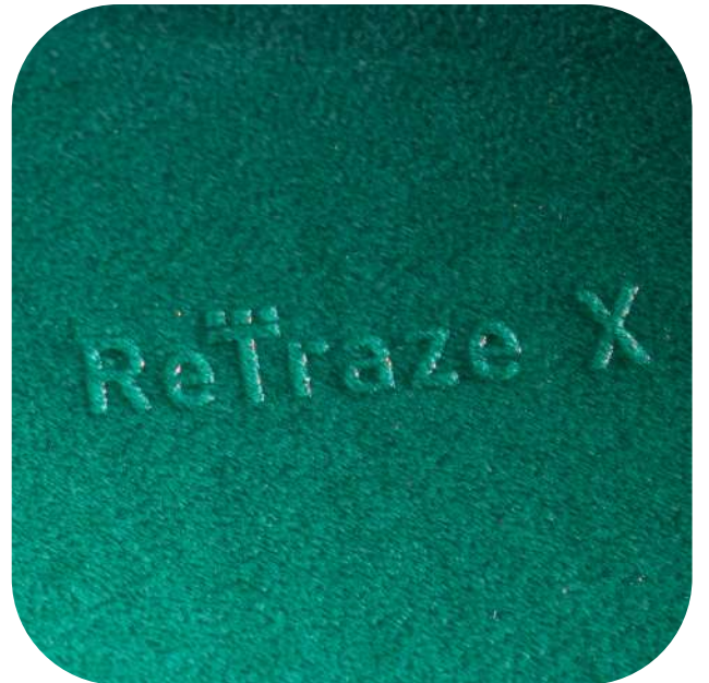
RETRAZE® FISHING NETS PANEL