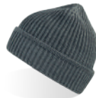
DK GREY MELANGE