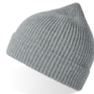
LIGHT GREY MELANGE