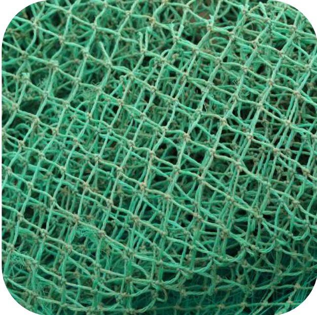
DISCARDED FISHING NETS

into 100% recycled PE ReTraze fishing net panels. The recycling process employed by ReTraze involves physical methods, including sorting, cutting, washing, melting, chipping, extrusion, and precision cutting. Through their efforts, they not only reduce waste, but also create a product that stands testament to the potential of responsible recycling.