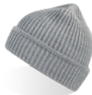
LT GREY MELANGE