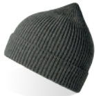
DARK GREY MELANGE